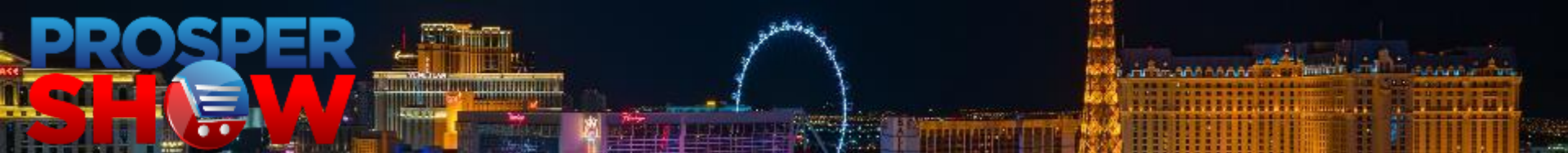
EXHIBIT HALL EVENING NETWORKING EVENT